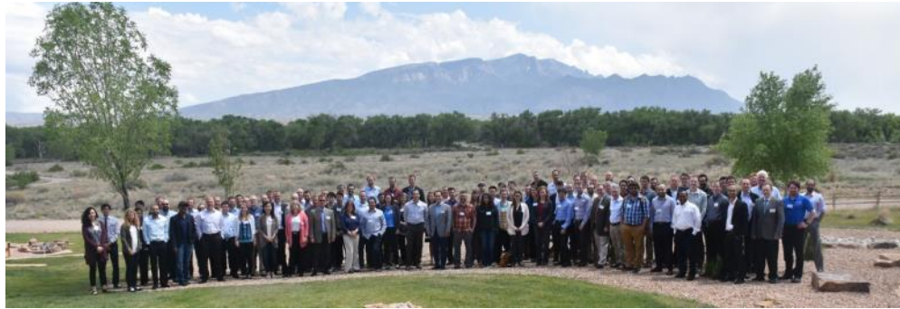
2017 Workshop in Albuquerque