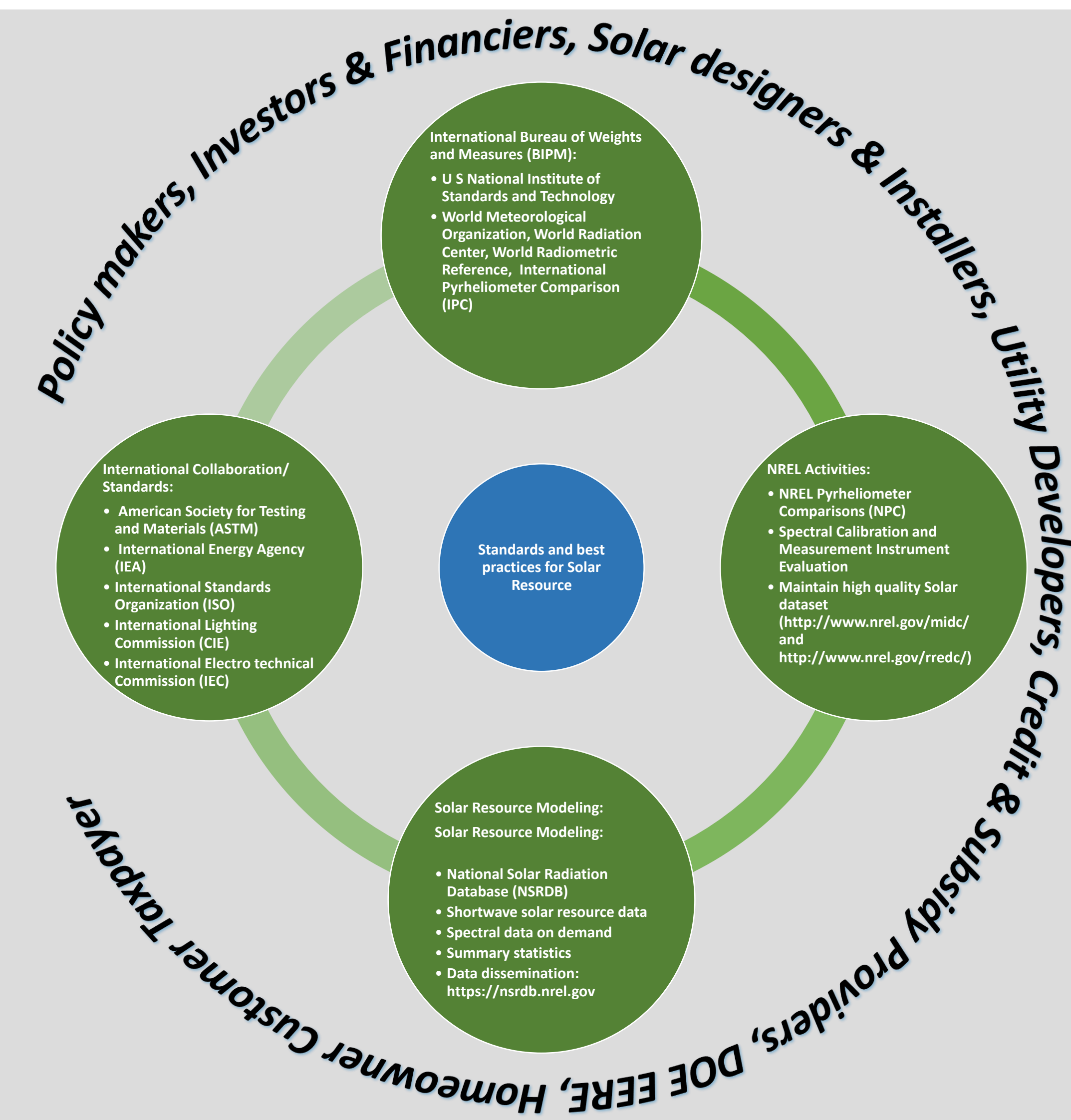
Fig. 2. Standards and best practices activities and associations

Solar Spectral Irradiance that includes increased sampling intervals based on explicit meteorological input parameters for the SMARTS 2.9.5 model.